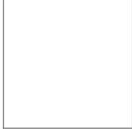
White - WHI (WHI)