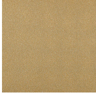
Jazz Gold - 29 (JAG)